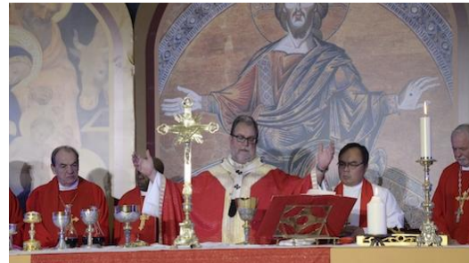
Bishops and Archbishops of the Patriarch's council

For the complete story and full audio of the messages go to www.cechome.com website for both download and streaming.