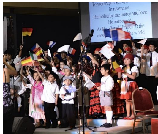
"For the Life of the World." Children's performance