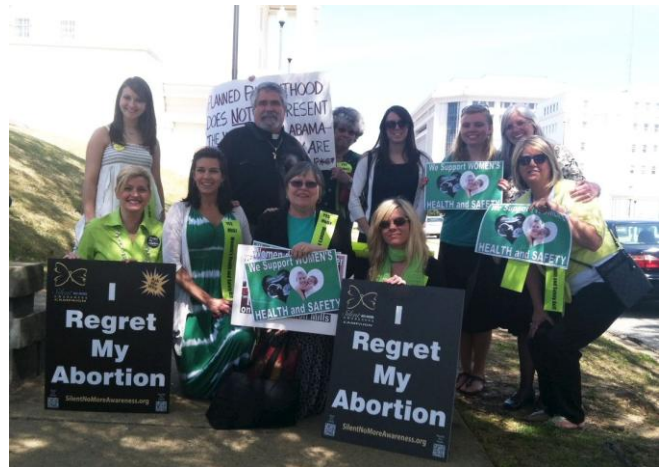
Alabama CEC For Life