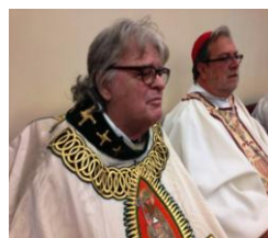
Archbishop Randolph Adler and Archbishop Craig Bates

While not officially announced or promoted, word of the event spread: a simple Eucharist to be held at Christ the King in Selma. All but two of the American bishops, including five Asian bishops who could make the journey on short notice, with 200 laity and clergy from dioceses in the American Southeast converged on this remote, historic town for a time of worship.